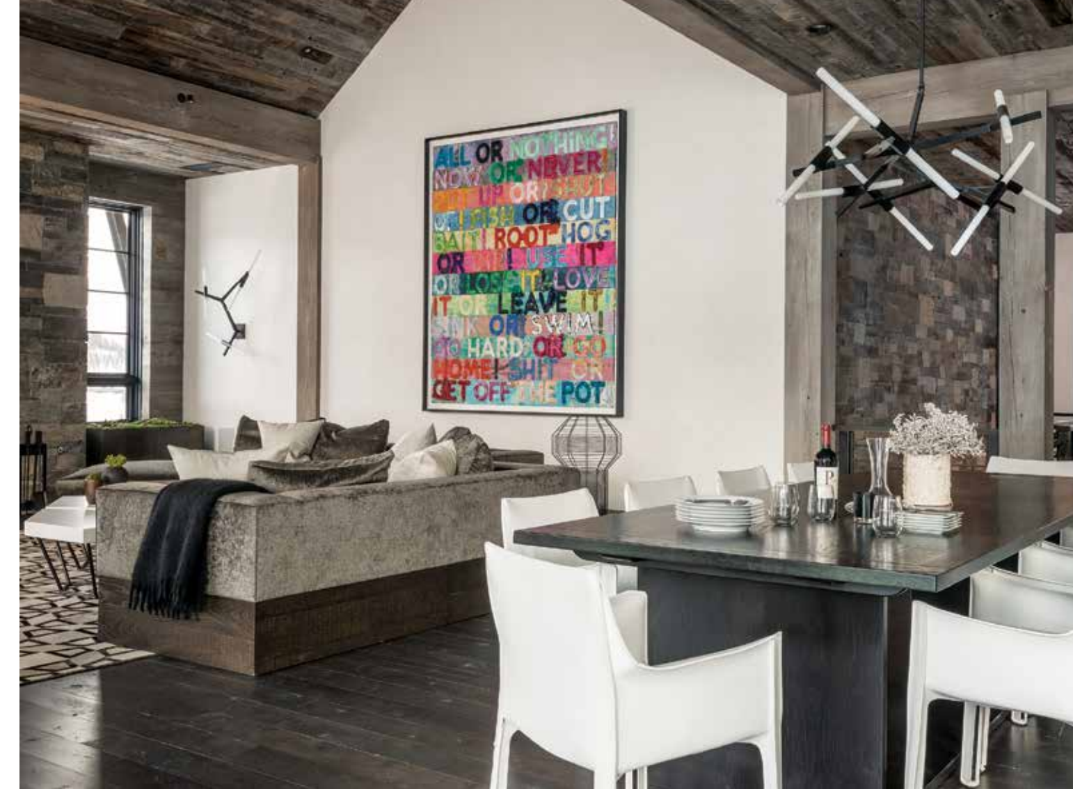
LEFT: Even the office offers spectacular views of the surrounding landscape, a key factor when working during a vacation. ABOVE: Warm neutrals, contemporary furnishings, and a pop of artful color make the great room a serene escape that is also multifunctional — perfect for entertaining or spending time together as a family of four. BELOW: The master bedroom incorporates unique finishes, such as a mirrored wall of glass that conceals a television.

when only the four family members were there. The architect created three distinct spaces by altering the ceiling planes, and by designating appropriate proportions for how each space should function. In the dining room, a low ceiling and light fixtures create an intimate area, while the elevated ceilings in the great room denote its prominence. The kitchen ceiling arches upward as well, creating a spacious feel for dinner parties, and keeping the space open and airy. Tucked off the kitchen is a coffee bar and, on the opposite side of the room, a comfortable breakfast nook provides the perfect spot for reading or casual meals.