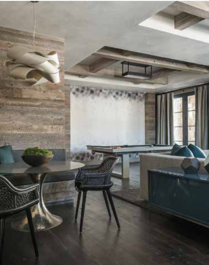
CLOCKWISE FROM LEFT : The home's elegant, formal entry leads to a staircase that climbs to the second-floor guest suites and third-floor master suites. On either side of the entry is a discreet caterer's kitchen and a gear room for skis. • Locati Architects designed outdoor areas to extend the home's footprint while maintaining privacy. • The home's open floor plan is perfect for entertaining. Appliances in the kitchen are hidden, leaving the space polished and uncluttered. • The second floor was designed with visiting family and friends in mind. Along with a bunk room and guest bedrooms, there is a comfortable living area with a bar, lounge, and space to play a game of pool.