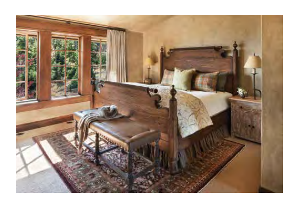
A combination of soothing neutral hues, warm wood furnishings, and softly-textured plaster walls in a guest room create a relaxing retreat.

The project was completed in December 2017, and the designers moved the homeowners' clothes and furnishings in — all the way down to the last fork in the silverware drawer. They even put up holiday decorations and set up the family Christmas tree. When the family arrived, they opened the front door and discovered the best present of all: Their splendid mountain house finally felt like home. •