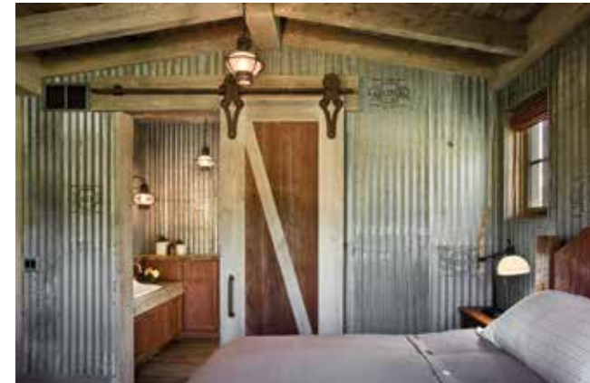
Utilizing galvanized, corrugated metal in a guest bedroom further ties the interior to the agricultural roots of the ranch property.

Inside, the line between interior and exterior living blurs. Enter what looks like a two-story farmhouse and find yourself in a great room with cathedral ceilings and a monumental view of Ross Peak.