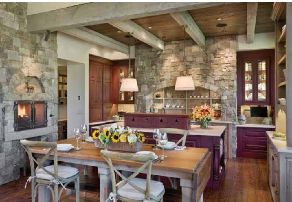
Clockwise from top: The vault of the great room punctuates the elegance of the timbers and capitalizes on bucolic views through oversized mullioned windows. • On the third floor, in what would have been the hay loft of a traditional barn, a luxurious bedroom looks out onto the Gallatin Valley. • In the kitchen the coziness of the hearth brings family and guests together in an intimate space tucked in from the great room by a lowered ceiling and a cloister of stacked stone.